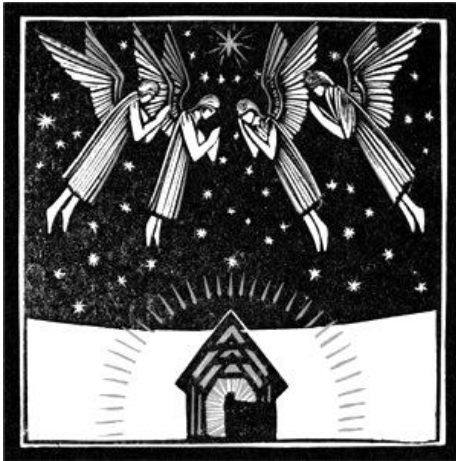
Eric Gill, Cantet Nunc Ite , wood engraving, 1916