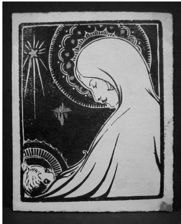
WR Watkins, woodcut, 1930