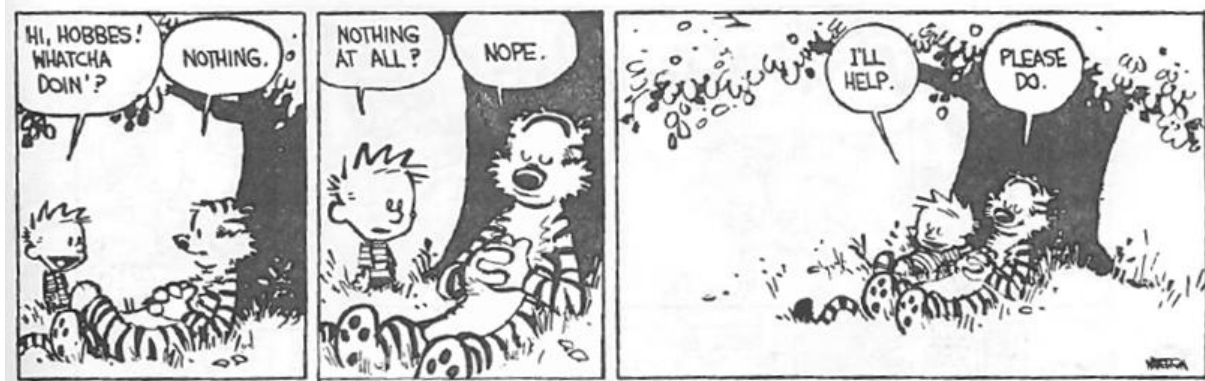
Calvin and Hobbes from Revenge of the Baby-Sat , by Bill Watterson

As you rest remember Christ, try not to allow yourself simply to become numb, rather as you rest, remember the God who became a man and chained himself to the cycles of busyness and tiredness, rest and restoration that we humans experience. Remember Christ's work done for you and experience His refreshing.