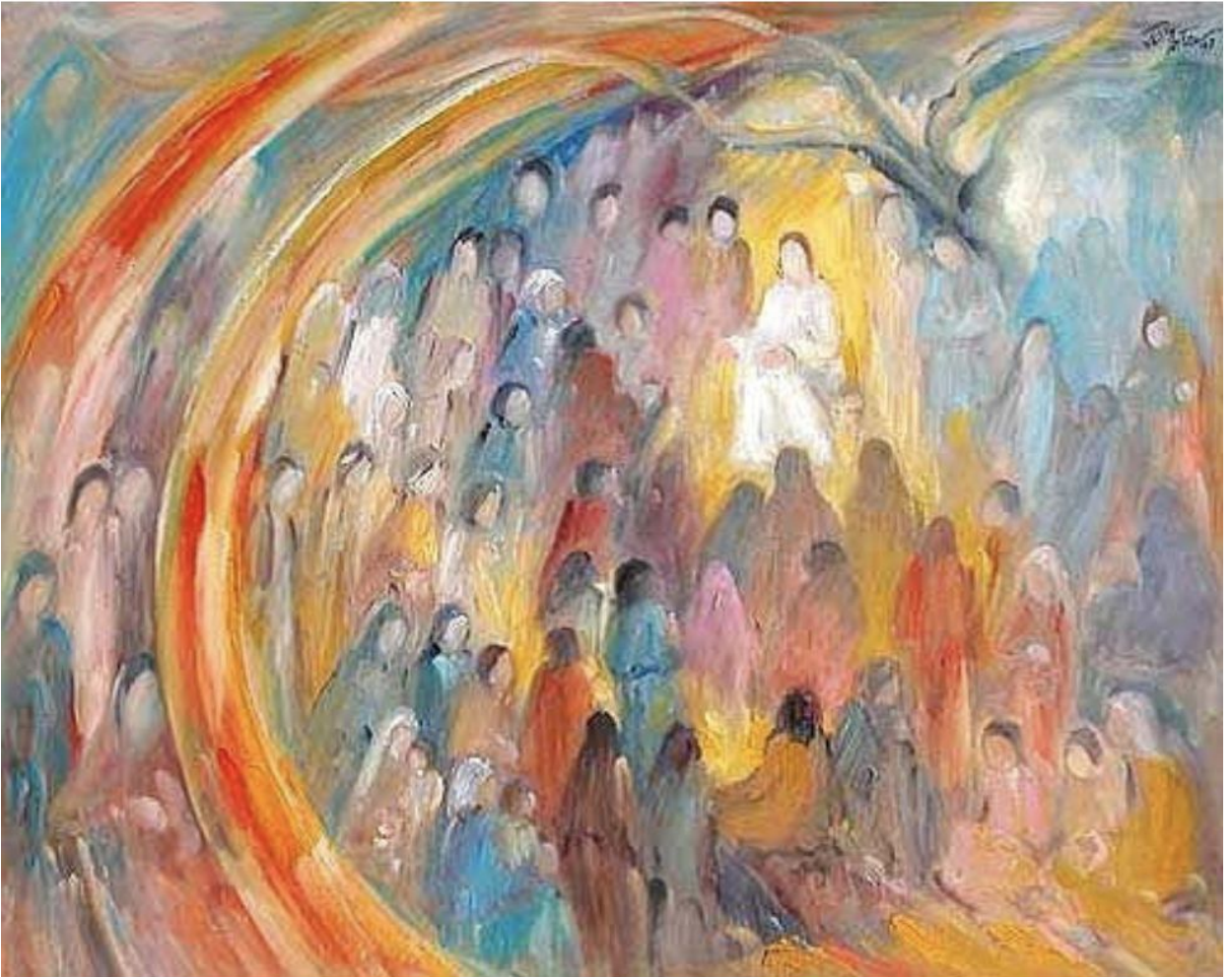
les Beatitudes, Joseph Matar