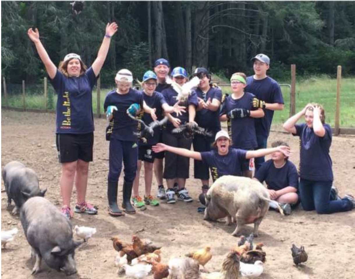
Serve Team - 2016

I continue to praise God for how he is using our youth, not only serving within Westview, but also beyond themselves. Serve has been significant part of the youth ministry. Students are challenged in their faith, not only by the long hours of serving in the community, but also in their personal faith. One of our students was extremely worried that she was going to be the worst of the group, when it came to helping others because she was so shy. God surprised her and used her in some wonderful ways within the group and those we served.