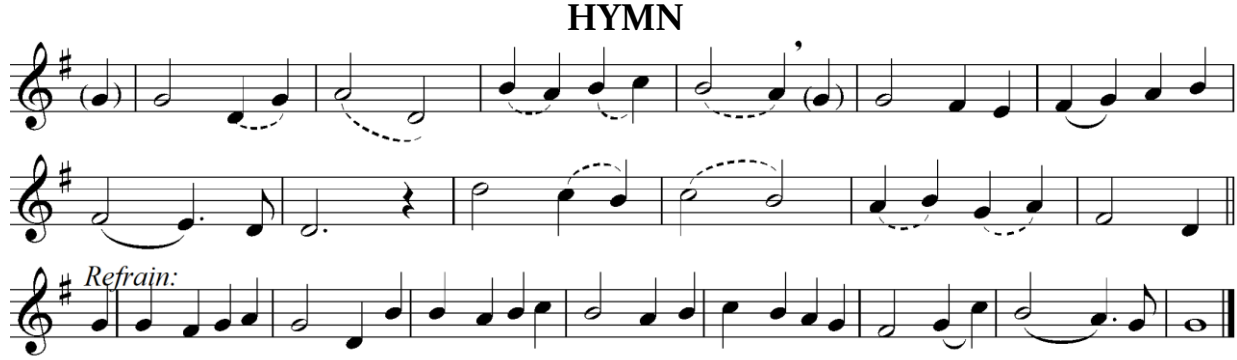
O come let us a - dore him, O come let us a - dore him, O come let us a - dore him, _ Christ__ the Lord.

O come ye, O come ye to Bethlehem; Come and behold him born the King of Angels: O come, let us adore him, O come let us adore him, O come, let us adore him, Christ the Lord!